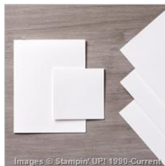
Whisper White 8-1/2" X 11" Thick Cardstock