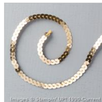
Gold Sequin Trim