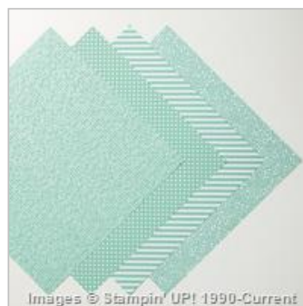
2015-2017 In Color Designer Series Paper Stack