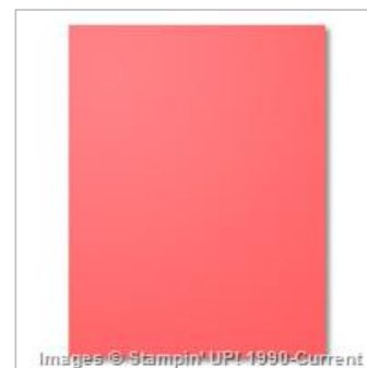
Watermelon Wonder 8-1/2" X 11" Cardstock