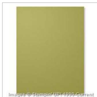
Old Olive 8-1/2" X 11" Cardstock