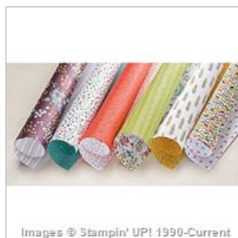
Wildflower Fields Designer Series Paper