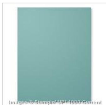
Lost Lagoon 8-1/2" X 11" Cardstock